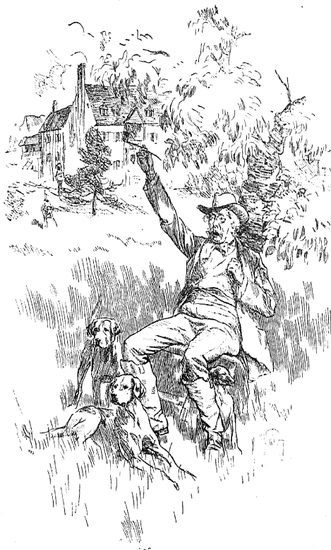
COLONEL BROOMSEGE: "LITE AND SIT AWHILE."—Page 80.